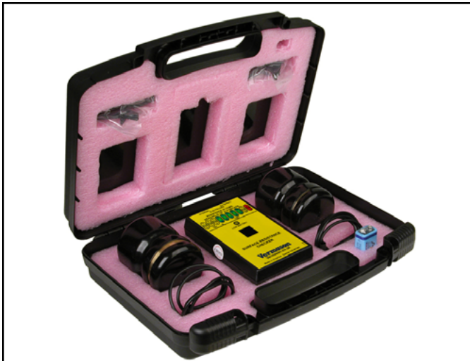
Figure 2. Vermason 225718 Surface Resistance Checker Kit