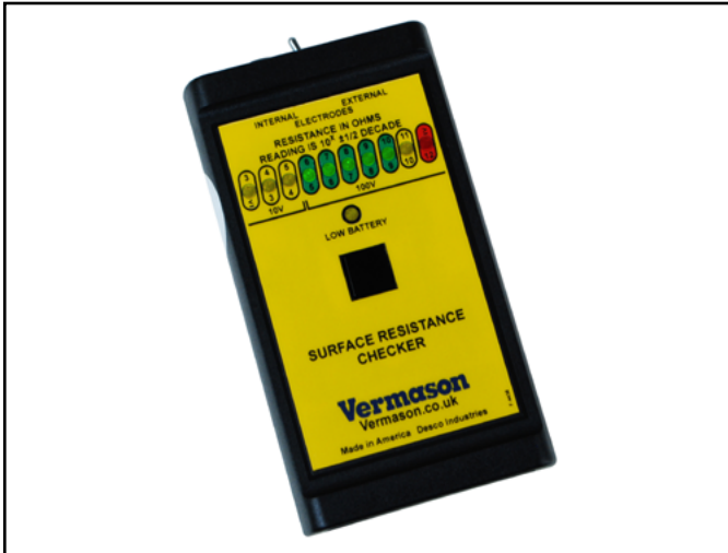
Figure 1. Vermason 225717 Surface Resistance Checker