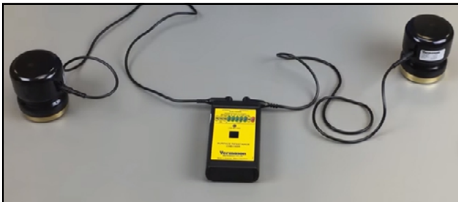
Figure 5. Using the test leads and 2.27 kg electrodes to measure Rp-p